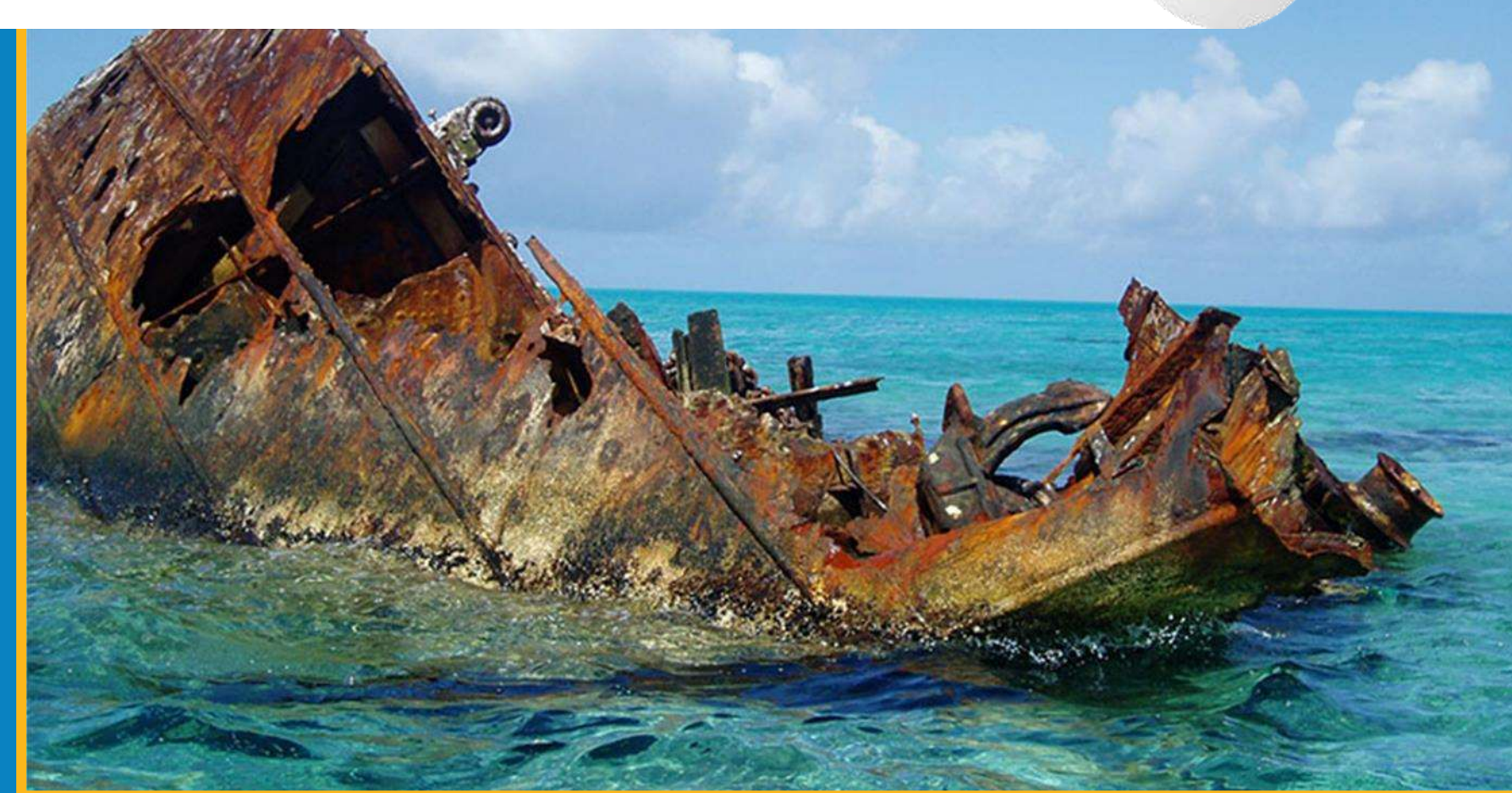
At the Papahānaumokuākea World Heritage Site in Hawaii, there are numerous metal shipwrecks as well as airplanes that largely date from the 18 th century and from WW II. Legacy pollution from these can impact the marine environment, and this is a testing ground for degradation studies.

Culture heritage is fundamental to understanding how many coastal and marine ecosystems achieved their present form, and to understanding the pressures upon them. Shipwrecks, for example, serve as aquatic nurseries and ecological niches.