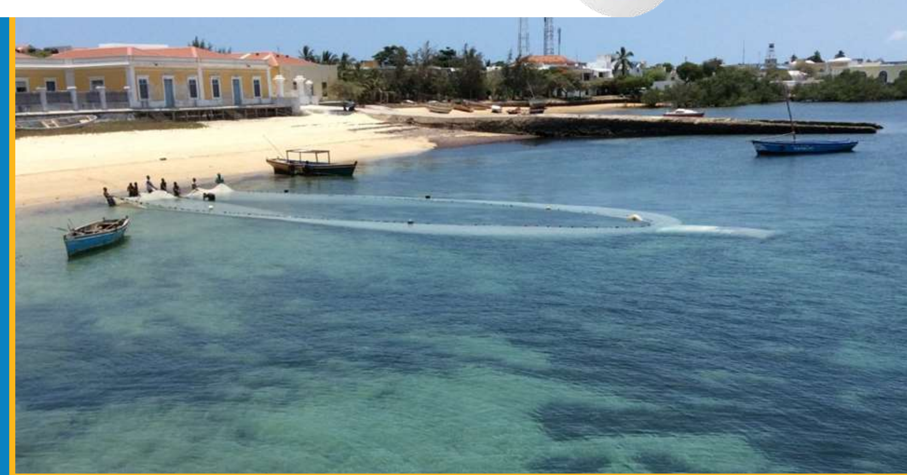
Fishing in traditional waters connected to important heritage sites in the coastal zone, Mozambique Island, Mozambique. Both sites and marine ecosystems can be impacted by pollution.

Cultural heritage can contribute to a clean ocean by enabling better understanding of the extent and risks of legacy pollution from shipwrecks, mining waste and land-based sources. A clean ocean is also important for the long-term preservation of MUCH.