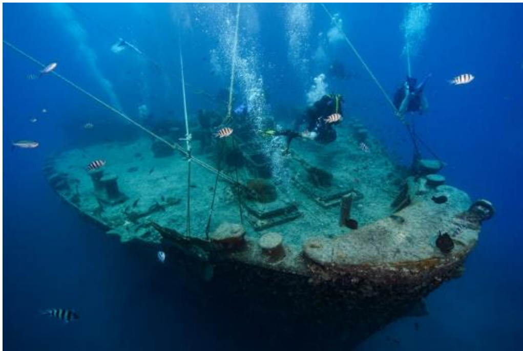
Figure 2. The popularity of the SS Thistlegorm in the Red Sea as a dive tourism location has come at a cost. Up to eight dive charter vessels each carrying around 25 divers visit the site daily over the summer season. These vessels weighing over 40 tonnes attach their mooring lines directly on to the superstructure of the wreck resulting in sustained damage. Current activity is unsustainable and a management plan for continuing tourism on the site is needed.