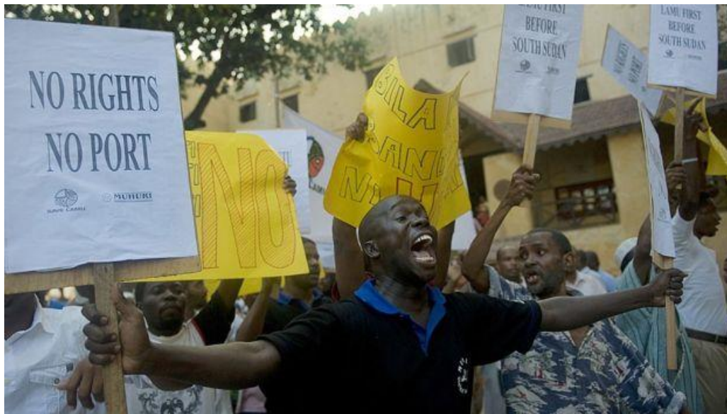
Figure 4. Lamu residents protest at the construction of a port at the historic town (Photo credit: ATP Tony Karumba).

The Lamu High Court ruling demonstrates that cultural heritage can play a vital role in redressing indigenous community rights, supporting individuals and communities to convey identities and values, fostering social inclusion and ensuring they have a say in infrastructural developments that directly affect their way of life. Indigenous coastal communities across the world are struggling to retain their sense of community and cultural identities as society undergoes rapid change associated with globalisation, development and disparity. These changes are contributing to their lack of ‘voice’ in important economic and cultural decisions affecting their lives and often undermining the intrinsic sustainability of these groups. The Lamu case highlights the importance of including local communities and their cultural heritage in development plans. Not only does this ensure that development is more inclusive, it creates fewer delays for developers and, most importantly, means that developments are more likely to be locally supported and therefore more sustainable. As the UN Development Programme notes ‘[g]rowth can be inclusive and can eliminate poverty only if all segments of society, including the marginalized, share the benefits of development and participate in decision-making’ [66].