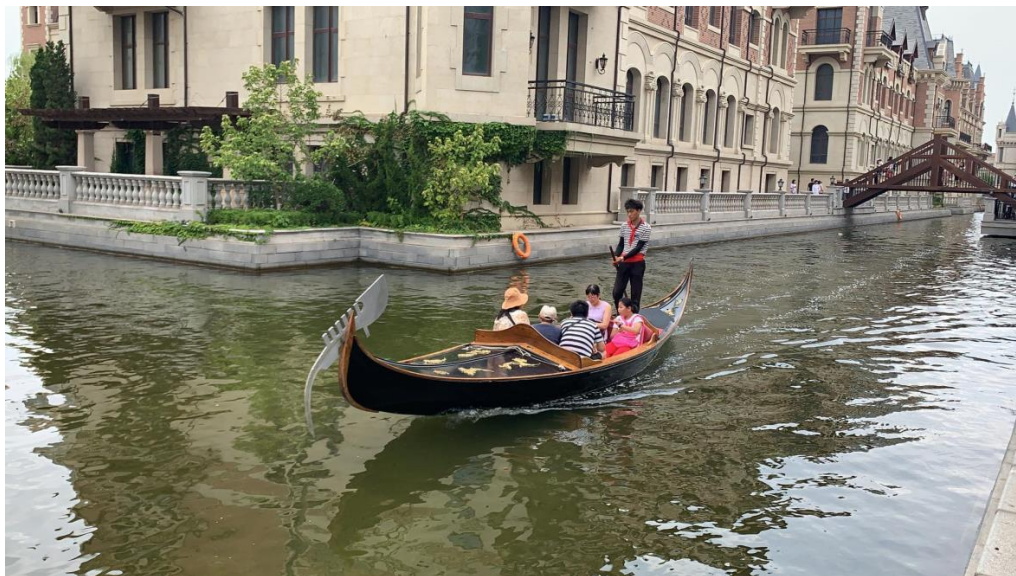
Figure 3. Welcome to Venice, China: canals, European palaces and gondoliers at Dalian.

There are other dangers in not having a strong professional heritage voice and awareness in the development process. The main ‘heritage’ tourism investment in Dalian has been the construction along the waterfront of what appears to be a replica of Venice replete with 4 km (2.5 miles) of canals, gondola rides, Italian architecture and frescoes (Figure 3). Although it is dubbed the ‘Venice of the East’ by local media, Dalian East District Corporation, the developers, instead use a bland but less culturally loaded name—the ‘East Montage’—to refer to the colossal $1.26 billion development. While admitting they took Venice as a blueprint, they claim it is not a building-by-building copy of the famed Italian town but rather a system of canals that allow visitors to pass through more than 200 ‘European-style castles’. What is certain is that the development has no connection with the rich maritime past of Dalian or the communities that lived and continue to live there.